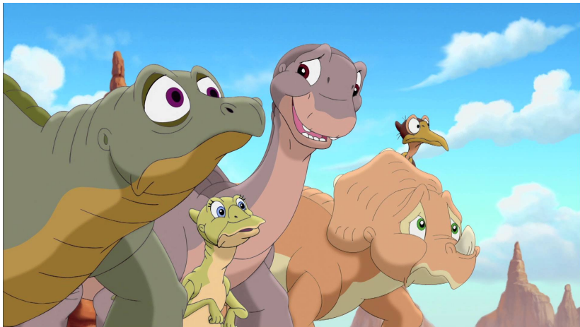
Figure 1: Evolve or die!